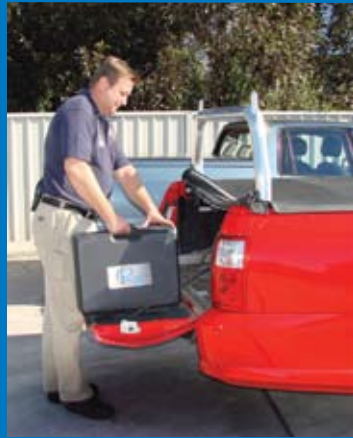
Pacific Porta Hoist is easy to transport and comes with its own convenient travel case