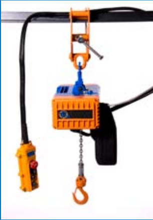
6m HOL with 5m Pendant and Chain Bucket standard. (girder clamp shown not included)