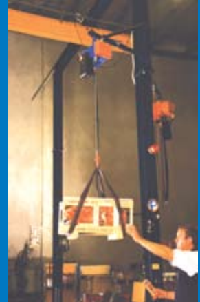
Lift up to 250kgs