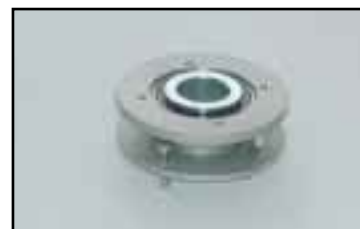
Bottom Swivel. To rotate the goods 360° while keeping the control unit in a fixed position. Suitable when placing boxes in a certain pattern on a pallet.