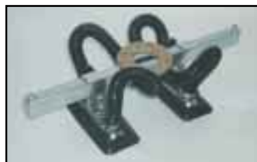
Yoke foot with two adjustable feet. Suitable for cardboard boxes with divided lid, materials in sheet form, etc. A large range available.