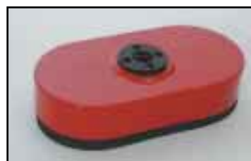
Oval suction foot. Principally for handling sacks but also useful for plastic shrink-wrapped goods. Available in several sizes.