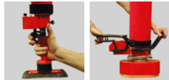
Control unit with sound insulation and ergonomic handles. Microlex is one-hand operated and Vaculex is two-hand operated.

Microlex is a small, handy model, very easy to use because it can be operated with one hand. For loads between 5 and 30 kg. With a pneumatic vacuum pump the unit is very easy to install, since the pump is mounted on the top swivel. A number of electric vacuum pumps are available, if required.