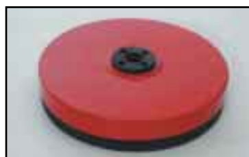
Round suction foot. Suitable for handling cans, drums, stones, bricks etc. Several diameters available.