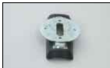
Curved suction foot. For lifting tubular frames, axles, drums etc. Available in customized sizes.