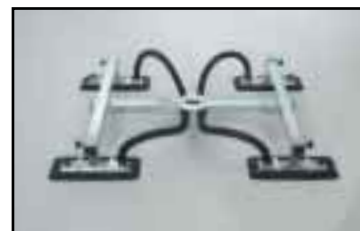
Cross yoke foot, (H-shaped), with four adjustable feet. Suitable for large steel sheets, board sheets etc. A large range available.