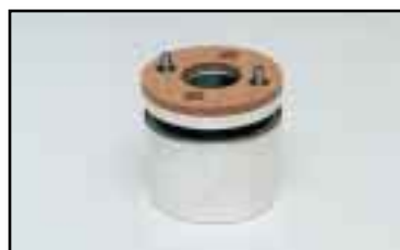
Bottom Swivel. To rotate the goods 360° while keeping the control unit in a fixed position. Useful when placing cartons in a certain pattern on a pallet etc.