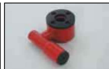
Release valve. Facilitates load releasing when large suction feet are used, for instance during vertical lifts. Available for standard as well as extended control unit.