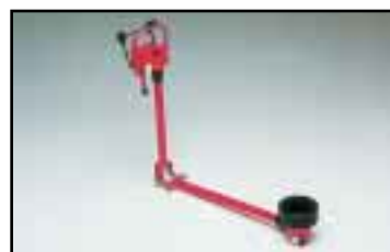
Flexible extended control unit. Useful when stacking goods high up on a pallet etc. Available in various lengths.