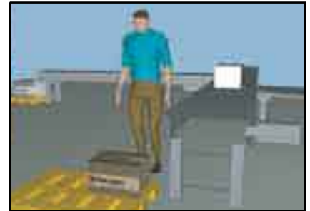
Ex 1. From pallet to table with a twist 10 kg box, 1 lift/hour = 14% get injuries within 2 years. 15 kg box, 1 lift/hour = 41% get injuries within 2 years.

For detailed information on different lift analyses, contact your Vaculex representative.