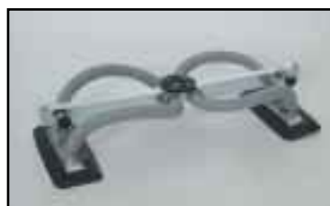
Yoke foot with two adjustable feet. Suitable for cardboard boxes with divided lid, sheets etc. A large range available.