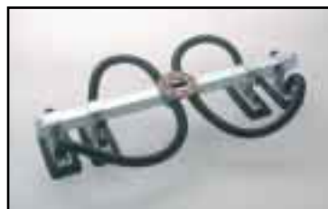
Yoke foot with four adjustable feet. Suitable for long, thin materials like steel sheets, board sheets etc. A large range available.