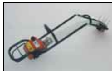
Flexible extended control unit. Useful when stacking goods high up on a pallet etc. Available in various lengths.