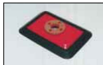
Rectangular suction foot. For handling goods with sealed surfaces such as cardboard sheet metal, plate etc. Many sizes available.