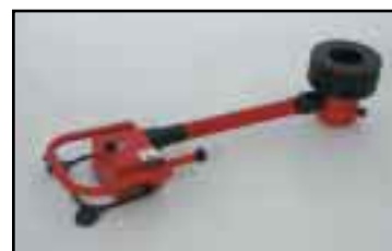
Rigid extended control unit. Useful when handling wide goods. Available in various lengths.