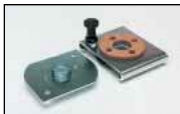
Quick disconnection. Bayonet joint type. Upper and lower part. For fast and simple change of suction feet/tools.