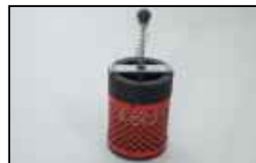
Protection valve. For safe lifts using fixed hooks/tools. Fitted in between the lift tube and the vacuum head. Eliminates immediately the depression inside the lift tube, if the goods is released inadvertently.