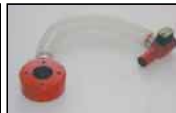
Release valve for extended control unit. Facilitates load releasing when large suction feet are used, for instance during vertical handling.