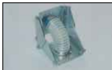
Angle adaptor. Suitable for moving, for instance, sheet metal from a horizontal to a vertical position or vice versa.