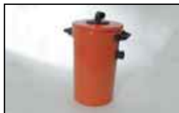
Large dust filter. Useful in dusty environments.