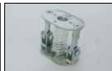
Angle adaptor. Suitable for moving, for instance, sheet metal from a vertical to a horizontal position or vice versa.