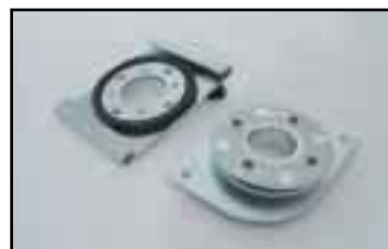
Quick disconnections. Bayonet joint type. Upper and lower part. For fast and simple change of suction feet/tools.