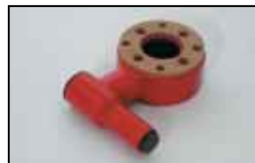
Release valve for standard control unit. Facilitates load releasing when large suction feet are used, for instance during vertical handling.