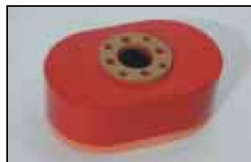
Oval suction foot. Principally for handling sacks but also suitable for plastic shrink-wrapped goods. Available in several sizes.