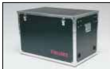
Sound reduction box. Available for all electric pump sizes.