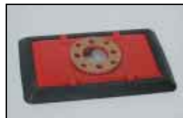
Rectangular suction foot. For handling goods with sealed surfaces such as cardboard, sheet metal, plate, etc. Many sizes available.