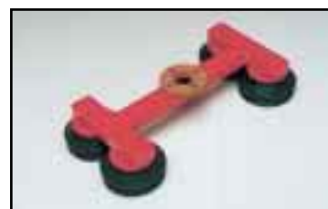
Fixed yoke suction foot with bellow cups. Useful for rough surfaces or on surfaces with differences in levels. Various models available.