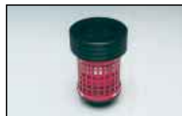
Protective valve. For safe lifts using fixed hooks/tools. Fitted in between the lift tube and the vacuum box. Eliminates immediately the depression inside the lift tube if the goods is released inadvertently.