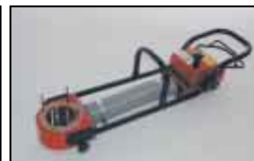
Rigid extended control unit. Useful when handling wide goods. Available in various lengths.