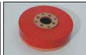
Round suction foot. Suitable for handling cans, drums, stones, bricks etc. Several diameters available.