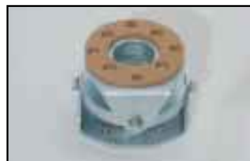
Universal joint. Fitted in between the lift tube and the vacuum head. Keeps the lift tube in a vertical position if load becomes unbalanced.