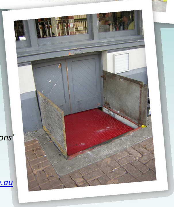
These two picture show the lift table from street level – Lowered & Raised

Technicaids Pty Ltd www.technicaids.com.au